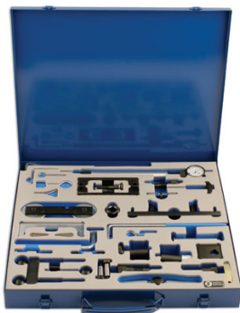
Tool and Crankshaft Pulley with Aligned Timing Mark