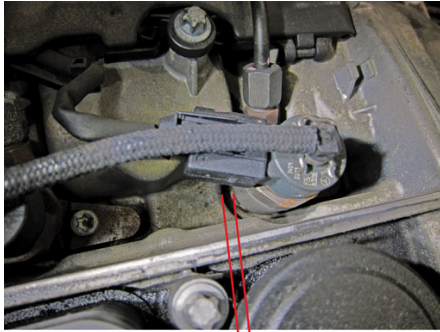
Image A This tool cannot be used on engines with this cam cover design (2.7 CDI/CRD)